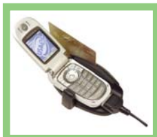
Serial Port Cradle