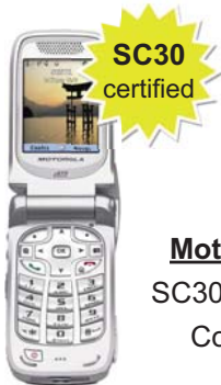
Sprint Motorola i850 SC30 and Cradle Compatible