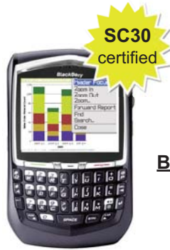
AT&T Blackberry 8700c Bluetooth