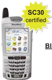
Sprint Blackberry 7100i Bluetooth