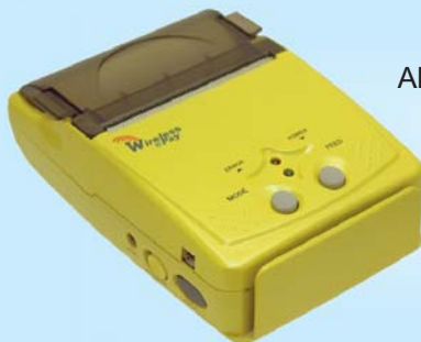
W-ePaySC30 All-In-One Bluetooth/Wireless Card Reader/Printer