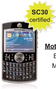
AT&T Moto Q Global Bluetooth Mobile OS