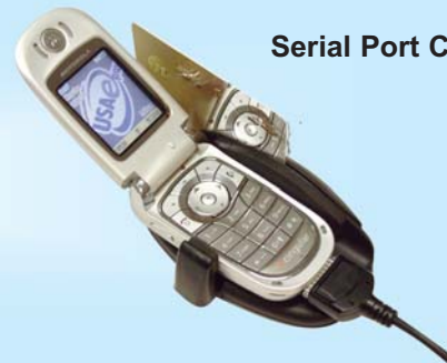
Serial Port Cradle

Note: All phones require a data package from the carrier for credit card processing. Updated 03/07/08