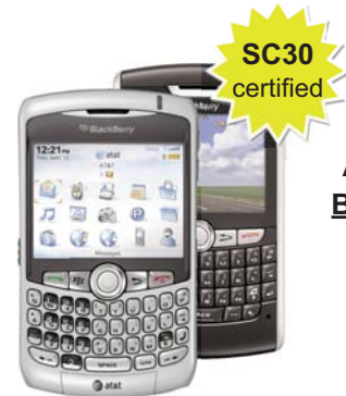
AT&T / T-Mobile Blackberry Curve Bluetooth