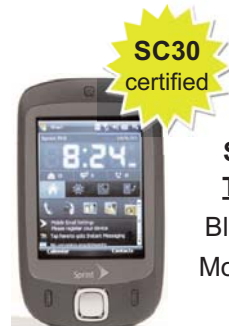
Sprint Touch Bluetooth Mobile OS