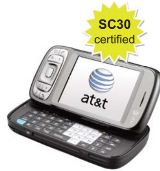
AT&T Tilt Bluetooth Mobile OS