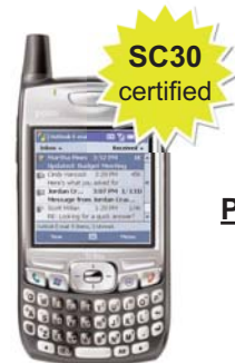
Verizon Palm Treo 700wx Bluetooth Mobile OS